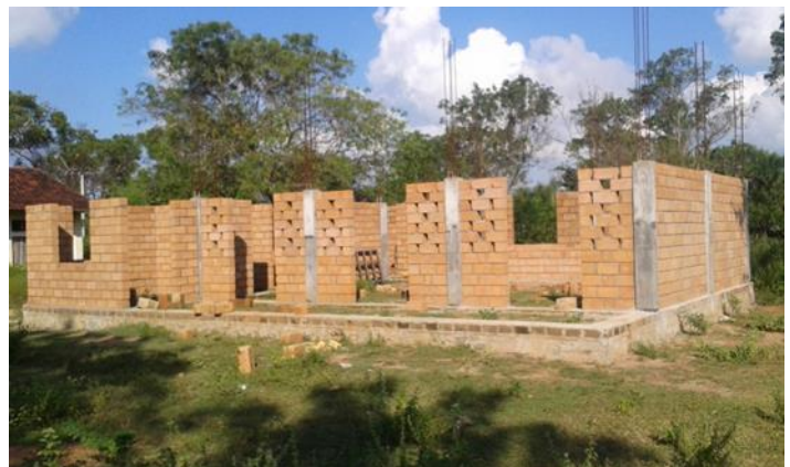
Construction work at lintel level.

The RCI project is being implemented in over 90 villages in the North and East and will run from April 2014 – March 2016 while the RCIF project will end in 2015. In total, the two projects will support the construction of 47 community centres, 40 preschools, 130 kilometres of internal roads and 16 kilometres of storm water drainage.