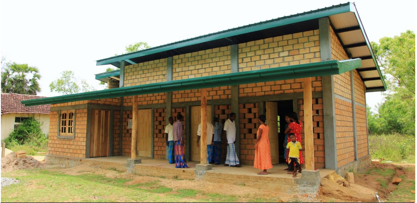
New community centre built using Mud Concrete Blocks is now nearing completion.

The Project for Rehabilitation of Community Infrastructure, Improvement of Livelihoods and Empowerment of Women in the Northern and Eastern Provinces (RCI) is a community infrastructure development project, contributing towards the sustainable rehabilitation and reconstruction of the conflict affected Northern and Eastern Provinces. Funded by the Government of Japan and implemented by UN-Habitat, it is assisting communities to overcome the hardships caused by the lack of basic services, whilst rebuilding human capital and empowering women.