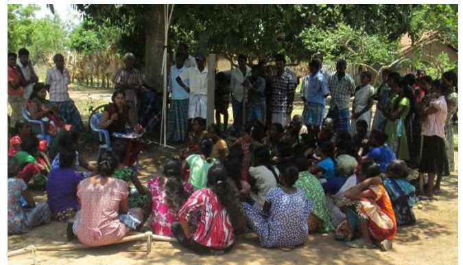
The residents had to hold meetings outdoors as they had no community centre.

To identify the priority infrastructure needs of the village, a Settlement Improvement Planning (SIP) workshop was conducted by UN-Habitat in June 2014. The Mahilavedduwan community identified several urgent needs including water supply schemes, introduction of new livelihoods, construction of houses as well as a multi-purpose community centre. The community centre was selected as the priority requirement for funding by the RCI project. As the village had no common building, the residents held their meetings and events outdoors, most often under a tree, creating numerous difficulties particularly during the monsoon rains.