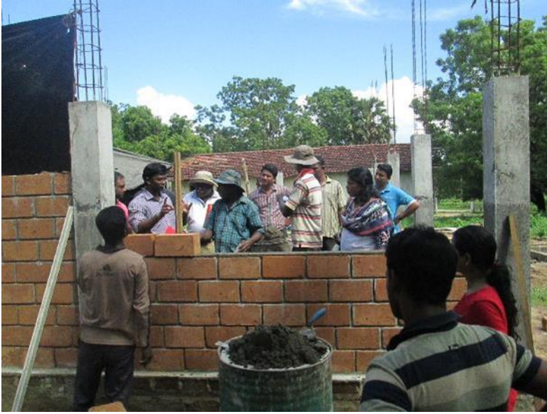
New community centre under construction with Mud Concrete Blocks.

Mahilavedduwan GN was affected by the three decades of conflict in Sri Lanka. From the 1990's to 2006, families faced multiple displacements. The village suffered significant damage and destruction to its infrastructure, economy and environment. Many families were forced to move to town areas and live with host families or in Internally Displaced Persons (IDP) camps to escape the fighting. In 2008, when people resettled in the village, the lack of basic infrastructure facilities created serious difficulties. The GN is particularly vulnerable as it has 72 differently abled persons and 80 female headed households. Several Government and donor funded programmes have provided large scale infrastructure support to the village including a road connecting the village to the tourist town of Kalkudah. The RCI project, commencing in 2014 April, recognised that investment in community infrastructure facilities can help achieve the twin goals of assisting people to have access to basic facilities while encouraging their resettlement in their villages of origin.